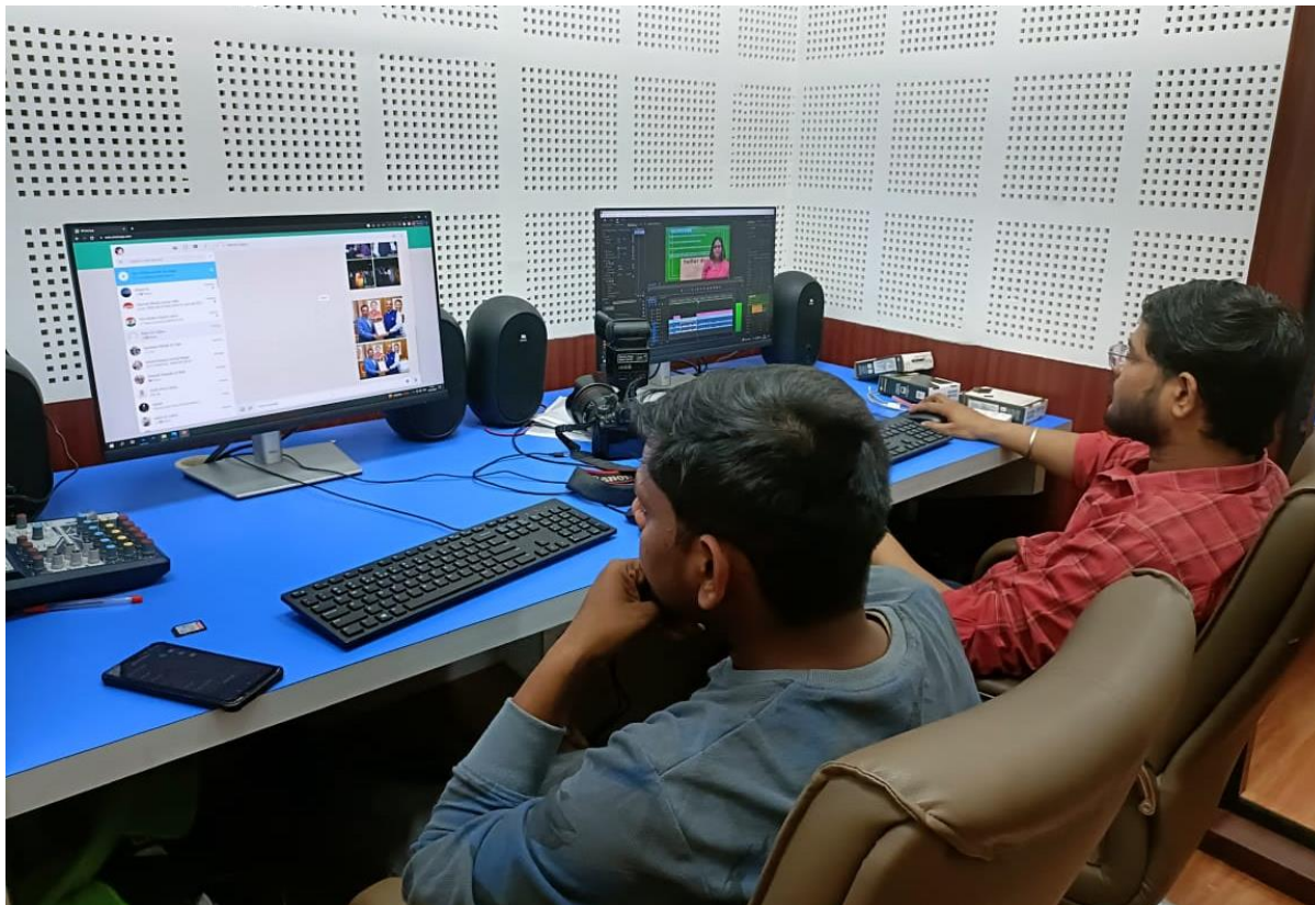
Figure 12 Editing setup in media centre DJMC, CSJMU