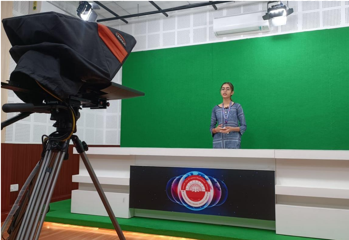
Figure 4 Chroma Studio setup in DJMC, CSJMU