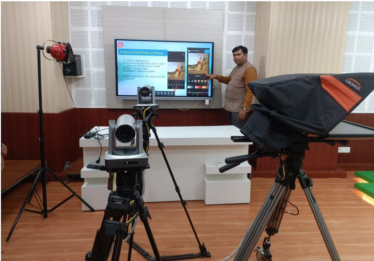
Figure 2 Lecture capturing system in DJMC, CSJMU