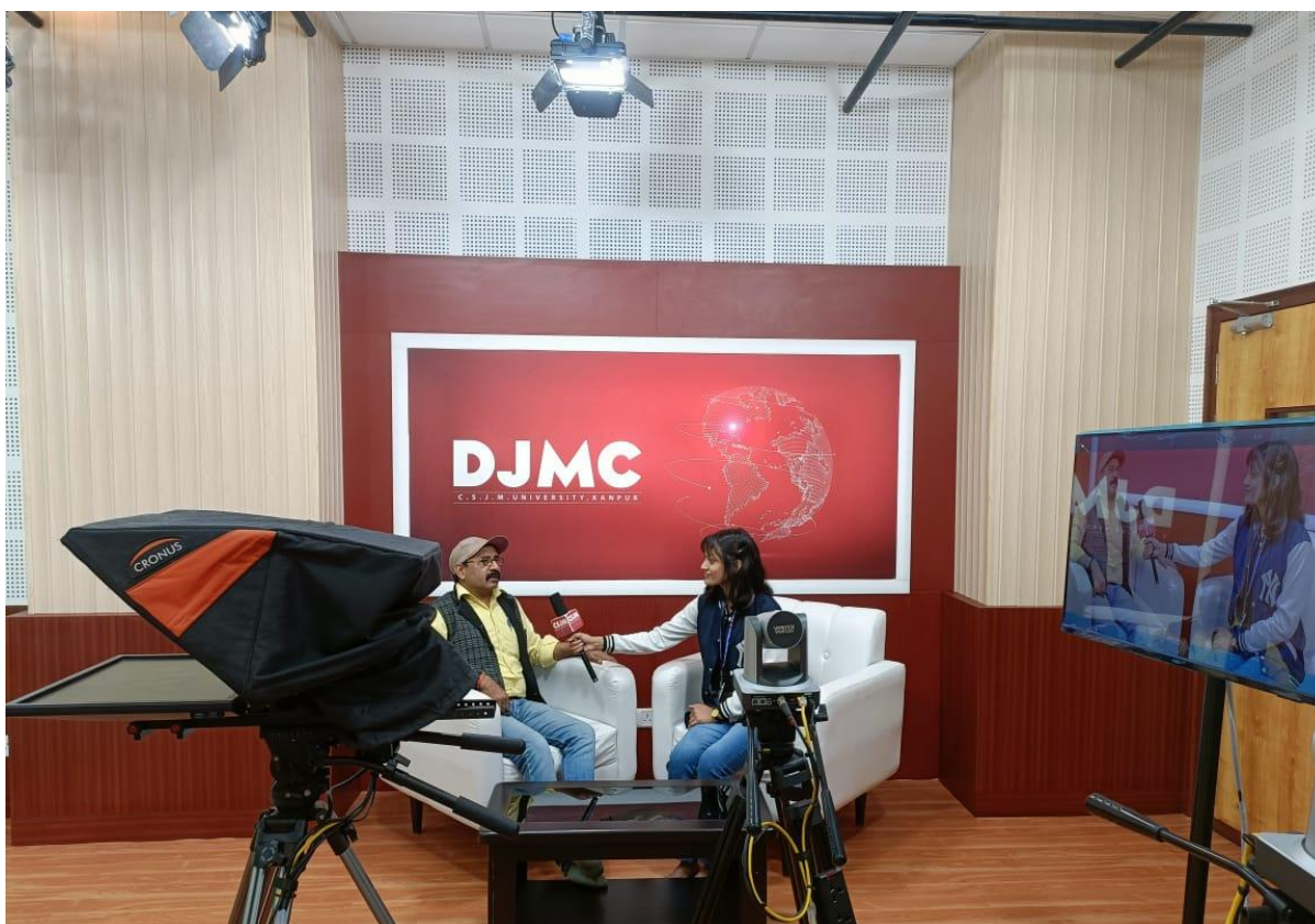
Figure 7 Media centre setup in DJMC, CSJMU