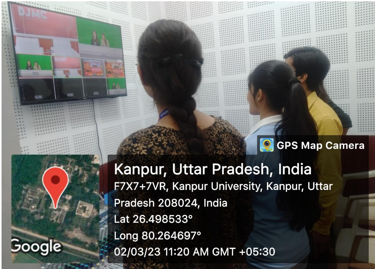
Figure 9 PCR in media centre DJMC, CSJMU