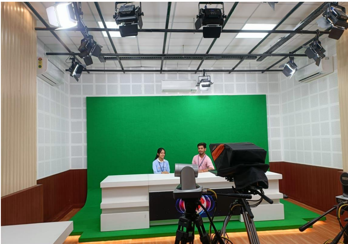
Figure 5 Chroma Studio setup in DJMC, CSJMU