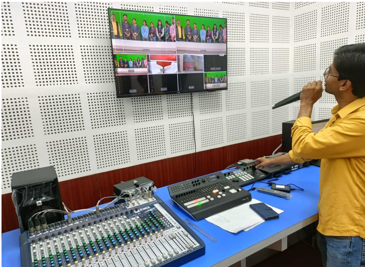
Figure 8 PCR in media centre DJMC, CSJMU