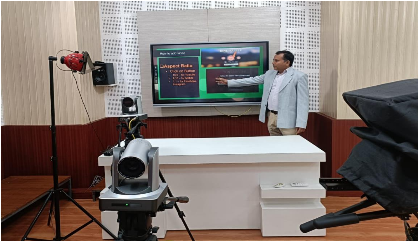
Figure 1 Lecture capturing system in DJMC, CSJMU

Overall, the Journalism and Mass Communication department's studio had an eventful and productive period, producing a wide range of content and providing valuable learning opportunities for students.