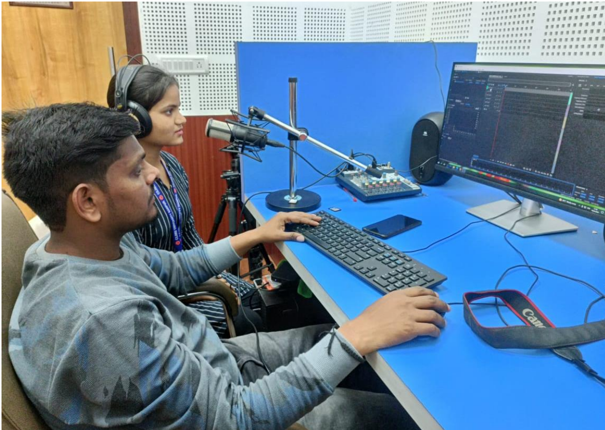
Figure 10 Audio system setup in DJMC, CSJMU