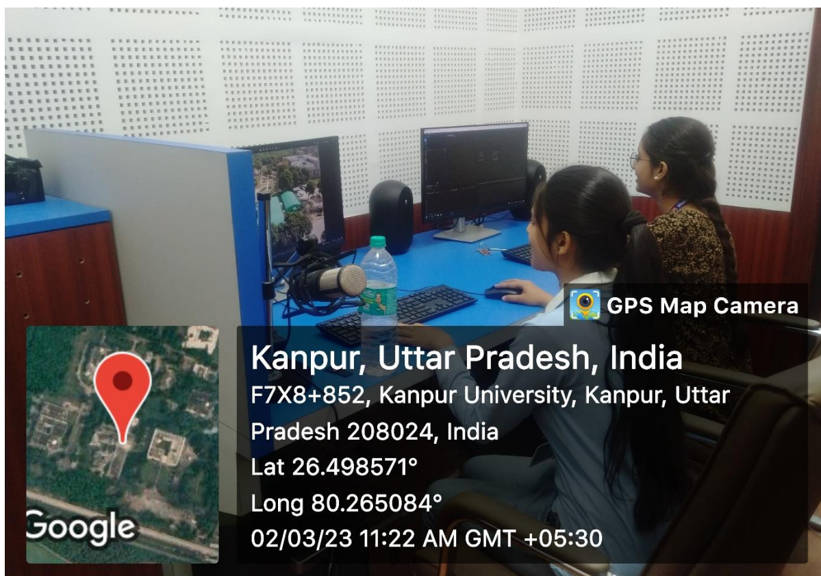
Figure 11 Editing system setup in DJMC, CSJMU