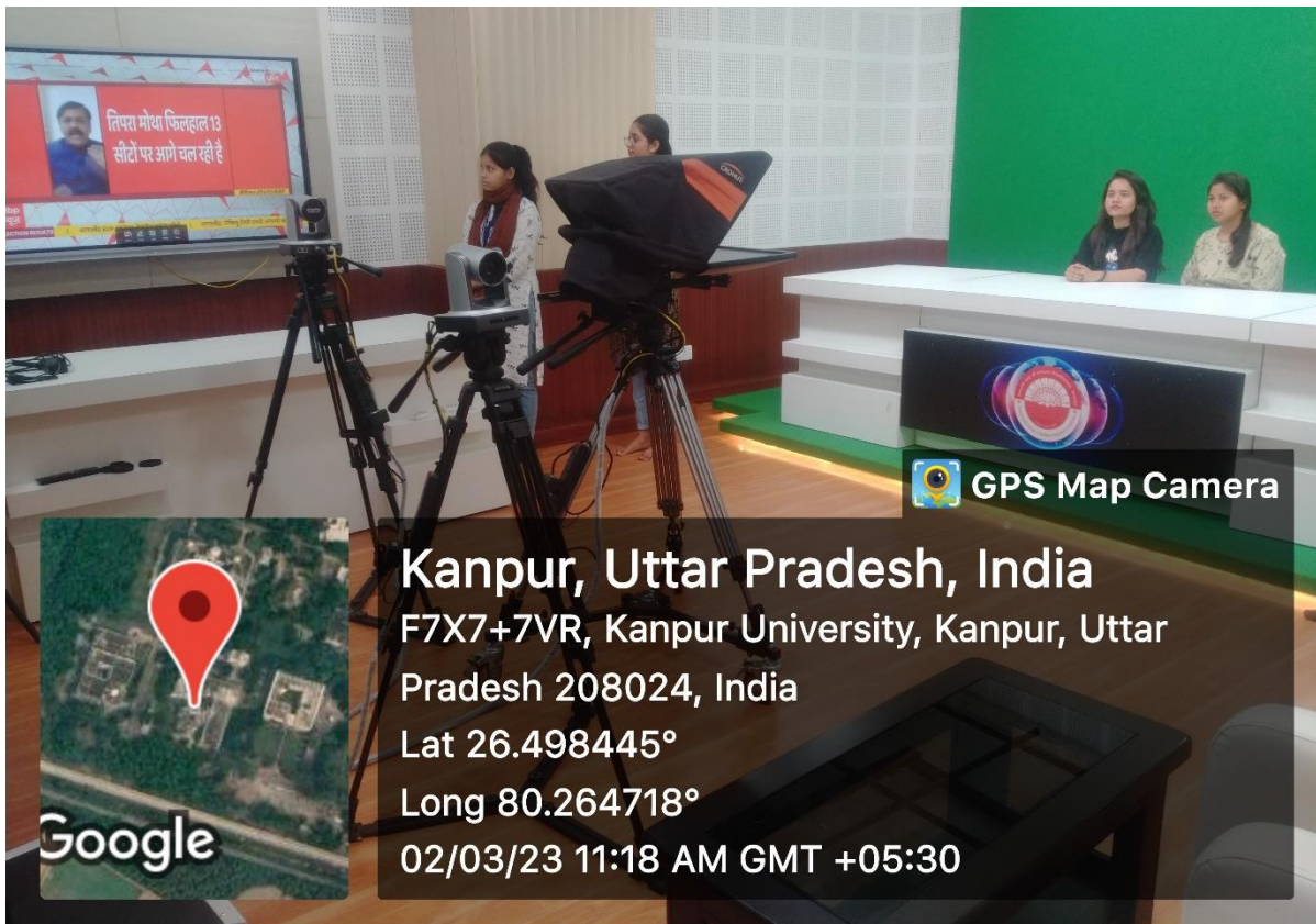
Figure 6 Chroma Studio setup in DJMC, CSJMU